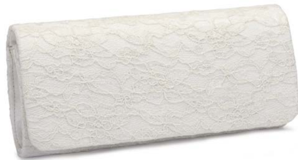
Pink by Paradox www.paradoxlondon.com