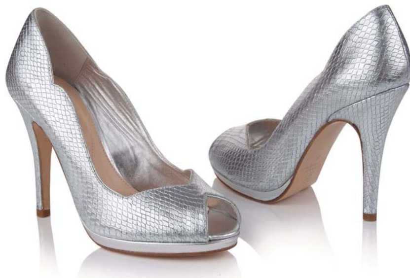
Rachel Simpson Shoes