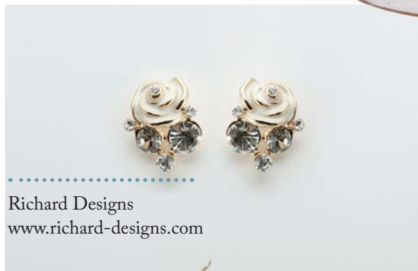
Richard Designs www.richard-designs.com