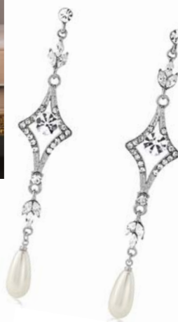
Glitzy Secrets www.glitzysecrets.com